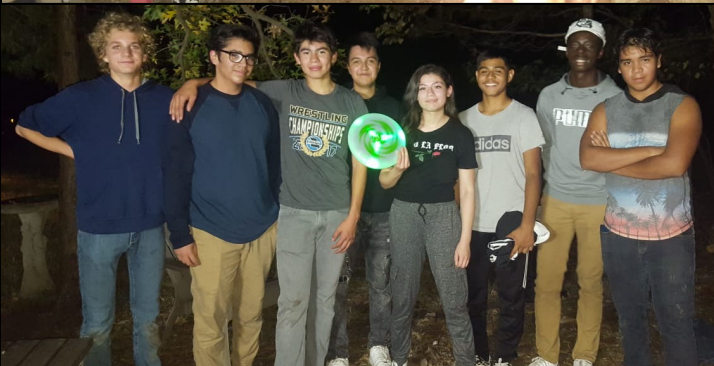
Above: members of our High School youth group have fun at the bonfire on October 20!