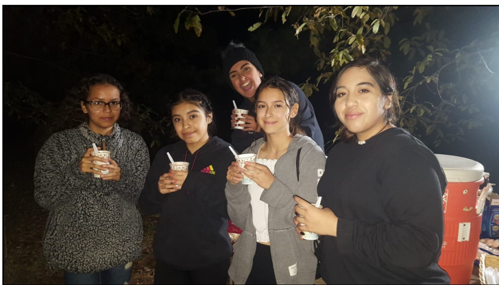
Miembros del grupo de jóvenes de la high school se divertieron en una fogata el 20 de octubre.