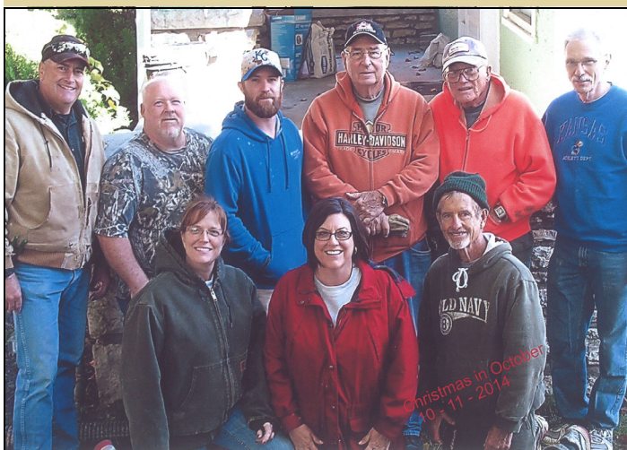
Pictured above are some of our volunteers from last year’s Christmas in October!