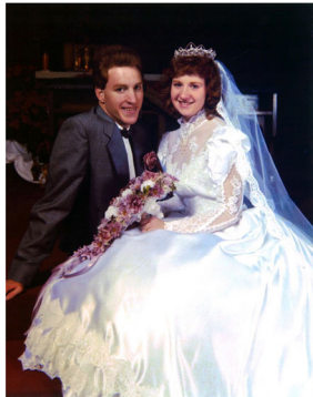
Married at St. Sabina December 27, 1987