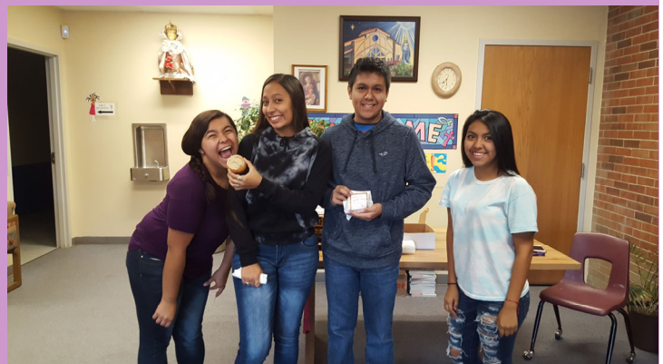
Los jóvenes están invitados a unirse para un desayuno y oración los martes a las 7am, antes de la escuela!

¡Luces Navideñas de Longview! El 7 de diciembre, los jóvenes de junior high irán a ver la hermosa exhibición Navideña en Longview Lake. Este es un evento especial que requiere que cada estudiante traiga una hoja de permiso. Debido al tiempo que tarda en recorrer las luces, nos iremos a las 7 pm y volveremos a las 9 pm.