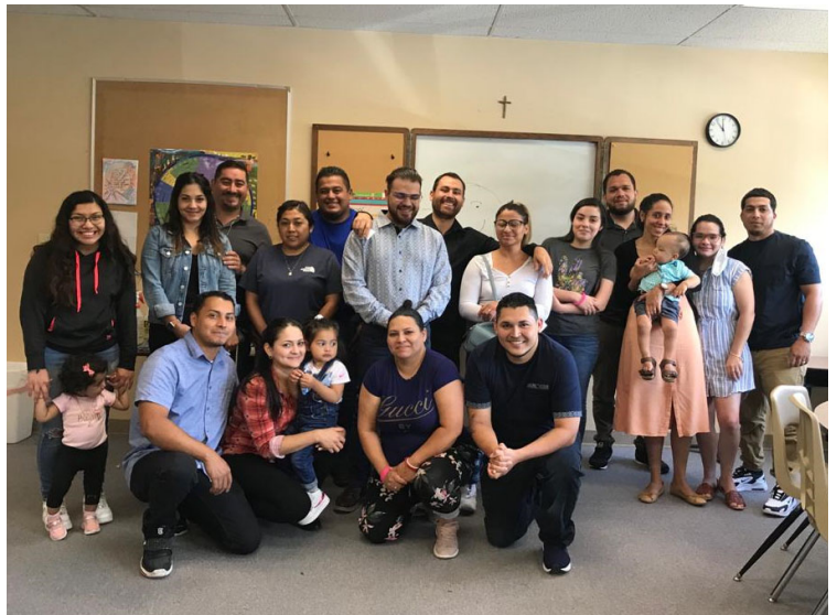
Pictured are those who attended the Spanish baptism prep session on July 10.

¡Nuestra parroquia ya tiene WhatsApp! Si desea recibir actualizaciones en español de la parroquia a través de WhatsApp, envíe el mensaje de WhatsApp "Español" al 816-331-4713. Para recibir actualizaciones en inglés, envíe el mensaje de WhatsApp "English".